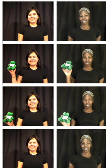
Fig. 1. Images of the White and Black actresses in Experiment 1. These same individuals were featured in all three experiments.

On each of four test trials, infants saw a toy choice event, with both White and Black individuals pictured simultaneously offering a toy to the infant. Just at the moment when the toys disappeared off screen, two real toys "magically" appeared from behind the table for the infant to grasp, giving the illusion that they emerged from the screen. The objects were attached by Velcro to PVC piping that rotated from behind the table, and landed on the table equidistant from the infant and in front of the silent and motionless images of the two individuals. Half of participants saw only these four toy choice events; half of participants saw each toy offering event preceded by speaking trials, in which each individual engaged in infant-directed native speech. The ordering and lateral positions of the White and Black individuals were counterbalanced across infants in each condition, and the individuals reversed sides after the second trial. Infants' first reach during a